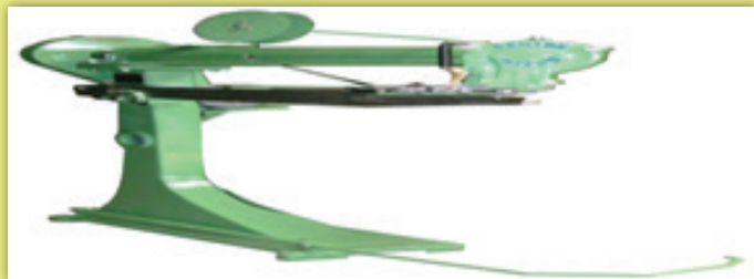
Box Stitching Machine. We have 4 machines. Size : 42" Size: 60" (Three Machines)