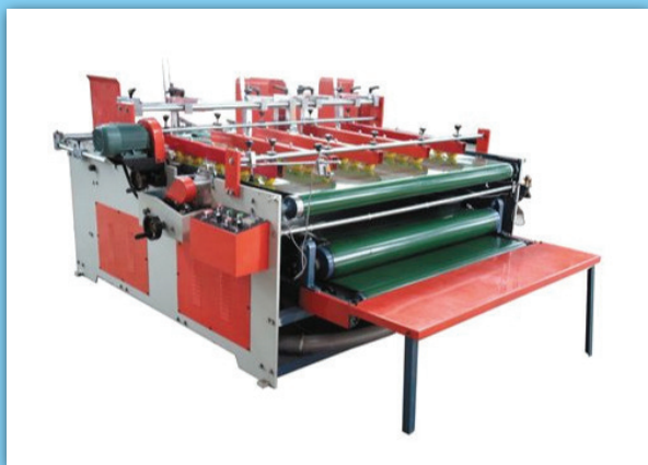
Side pasting Size : 40"x75