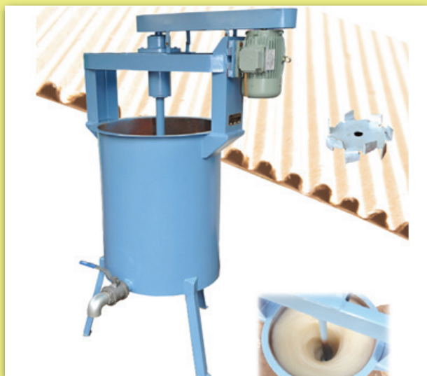
Corrugation gum tank We have two gum tanks Size : 400kg (corrugation gum tank) 600kg (pasting gum tank)