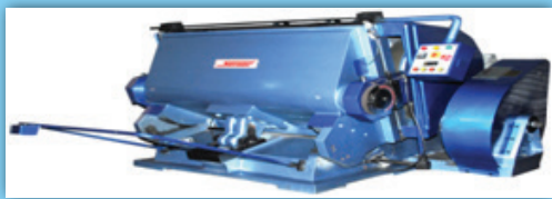
Die Cutting Machine. Size : 35"x45'